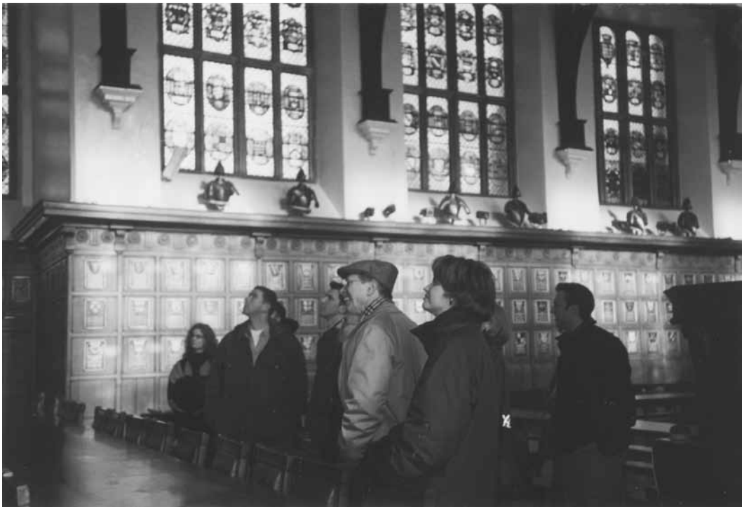
Students view the Middle Temple Hall during a walking tour of the Inns of Court.