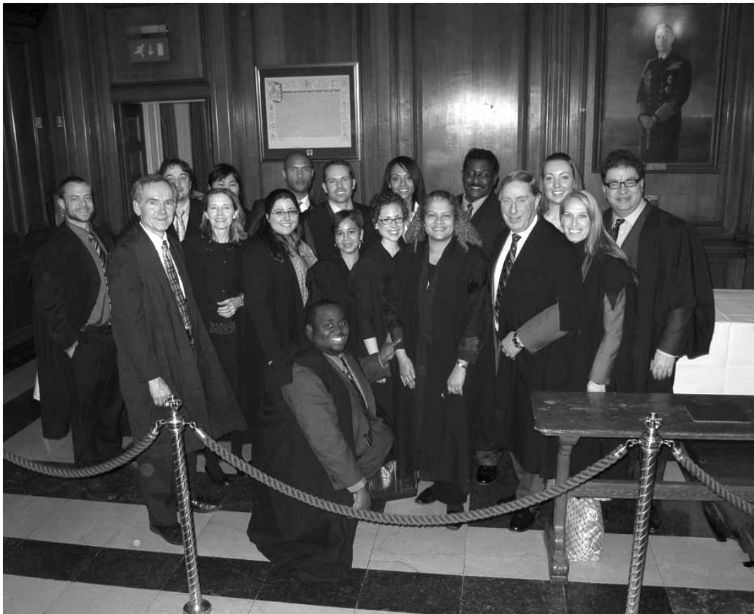
Students and faculty having dinner at Inner Temple with barristers

Final exams will be held over a five-day period during the week of April 25 - April 29, 2011. (See "Schedule of Final Examinations," p.17). Depending on their course selections, students may have one or two exams per day on consecutive days. Exams will not be re-scheduled for this reason, and all students will be required to take exams as scheduled. Please note that no laptop computers or other electronic devices may be used for traditional exams.