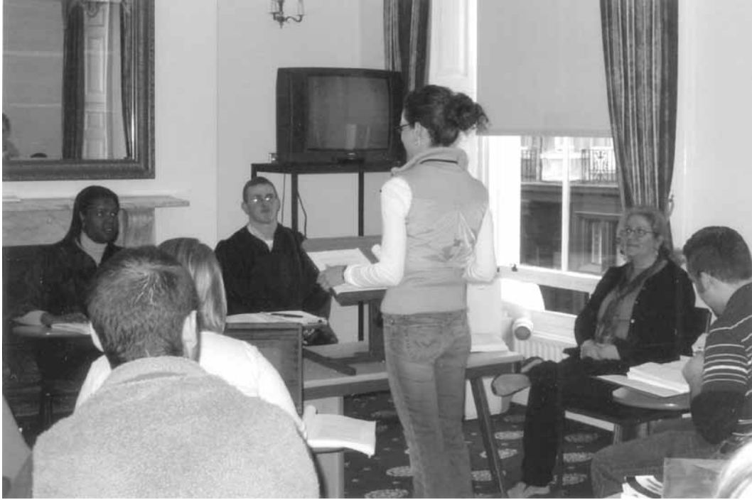
Students participate in a mock evidentiary hearing during class.