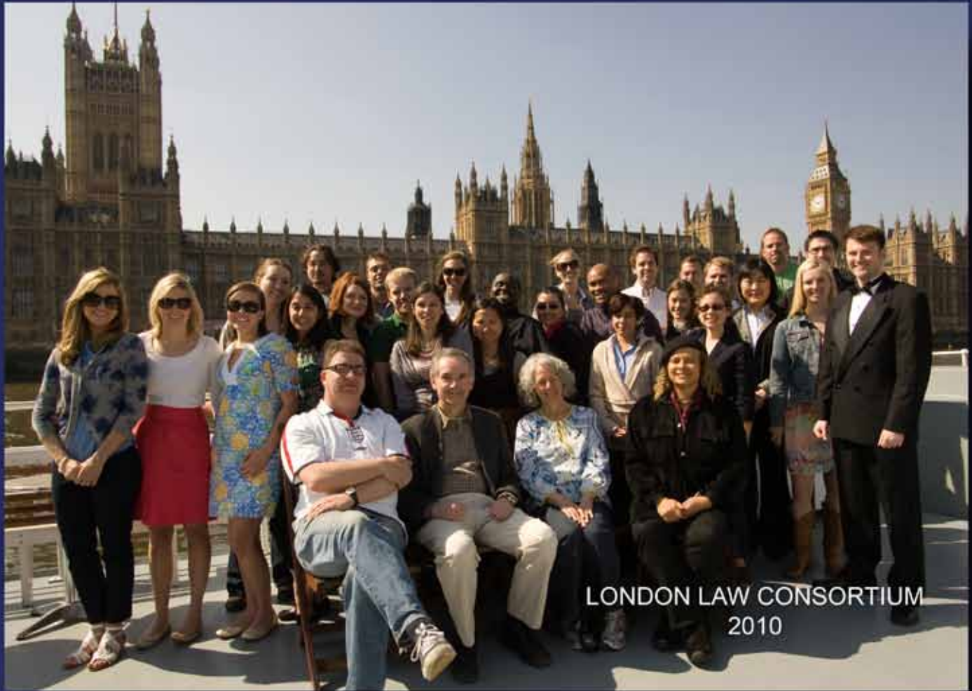
LONDON LAW CONSORTIUM 2010