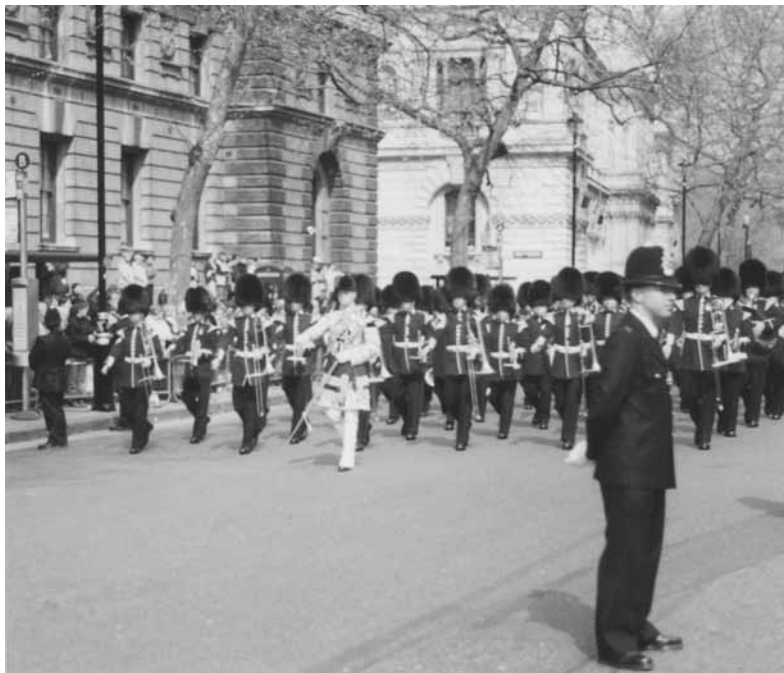
The pageantry of London is unsurpassed.