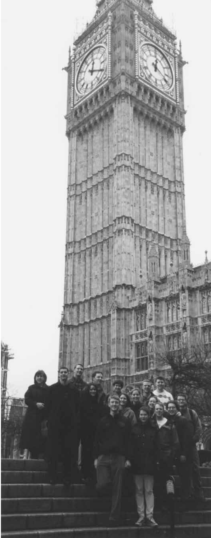
Students are taken on a tour of the Houses of Parliament, where they visit the historic Westminster Hall (below).