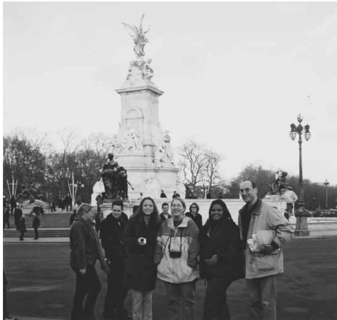
Students gather outside the gates of Buckingham Palace, during the Consortium’s coach tour of London

Students will receive a list of required texts several weeks in advance of the commencement of their classes. Students must bring with them to London all required texts for the American law courses they will take during their semester abroad, as they will not be available for purchase in London. Required texts for British and EU law courses will be available for purchase in London. The Consortium does not place book orders on the students’ behalf, so students must arrange for the purchase of these textbooks with their law school bookstores, or order them directly from the publisher. Book-sharing by students is not permitted, and every student must have all required textbooks in order to take final exams.