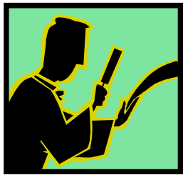
The USA PATRIOT Act continues to be a hot topic within the law library community.