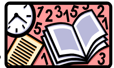
Utilizing the library helps students get the most out of their years in law school.

The aim of this newsletter is to provide details regarding these and many other opportunities that the Wheat Law Library provides for the student body. The library exists primarily to serve the students and faculty of KU Law, and our staff members work hard in pursuit of this goal. After perusing the possibilities please do not hesitate to take the time to come in and talk with a librarian about an activity that interests you. Before you dismiss all of this as mere self-promotion, consider that lawyers, unlike those in many other professions, must have more