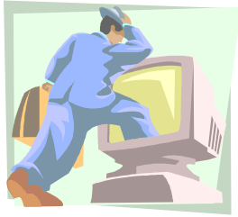
The library continues to add great new electronic resources for students and faculty.